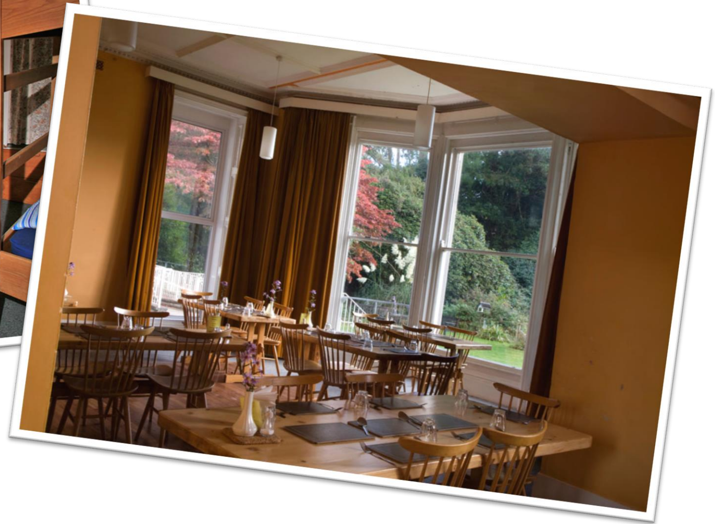
Accommodation and dining